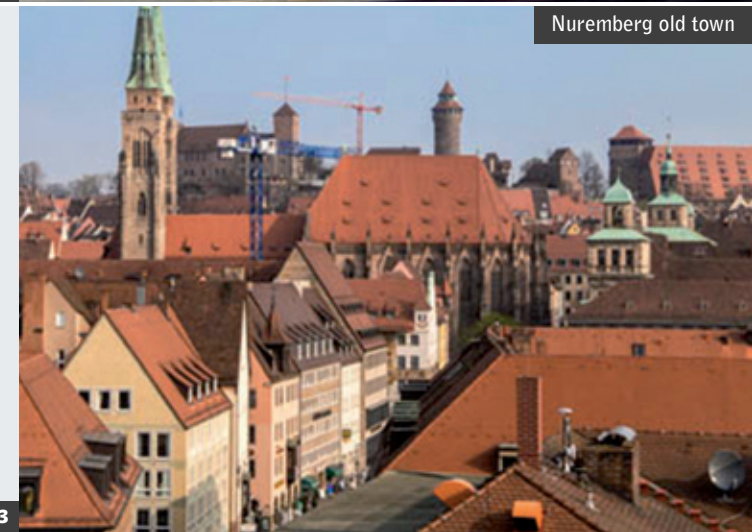
Nuremberg old town